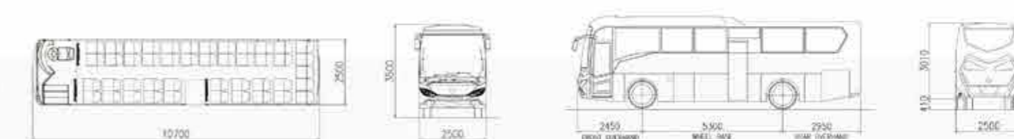
HOLA SG: 45-Seater with 2+2 seating layout